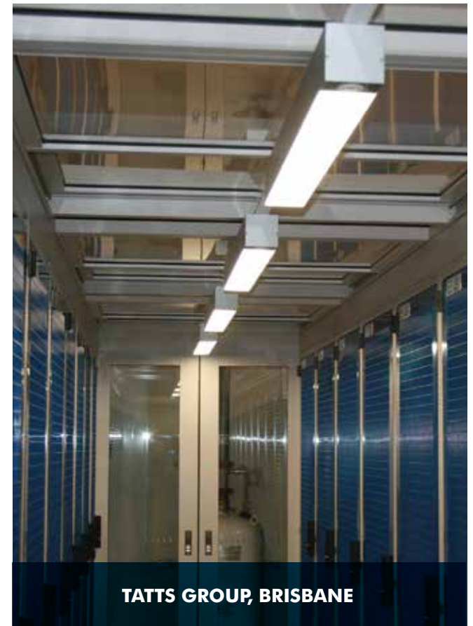
TATTS GROUP, BRISBANE