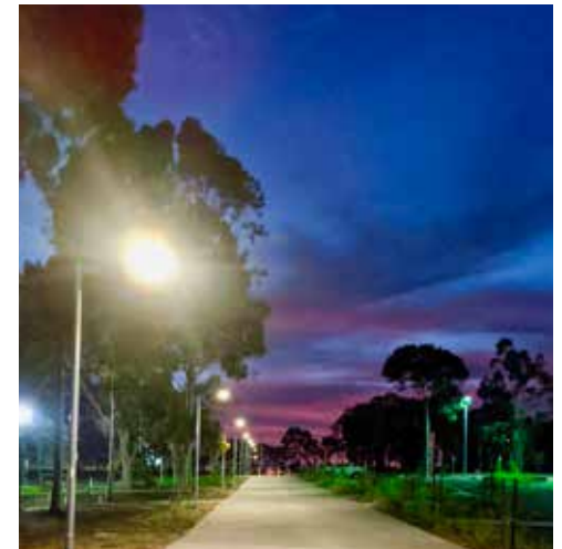
PARKS & RECREATION